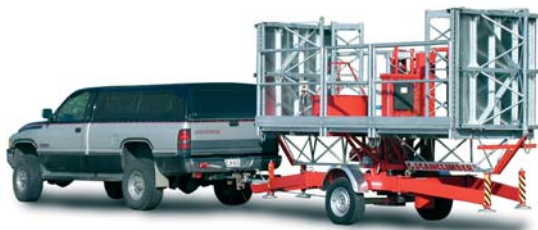
Transportation by towable Trailer Chassis

Single masted platform length up to 10 m and twin masted up to 25 m.